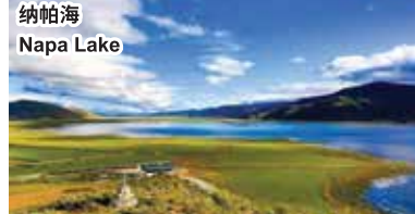
纳帕海 Napa Lake