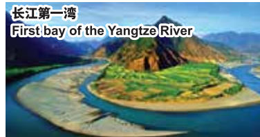
长江第一湾 First bay of the Yangtze River