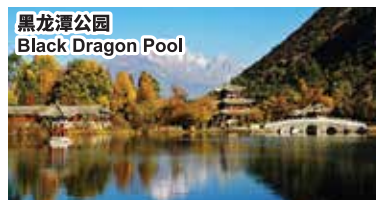
黑龙潭公园 Black Dragon Pool