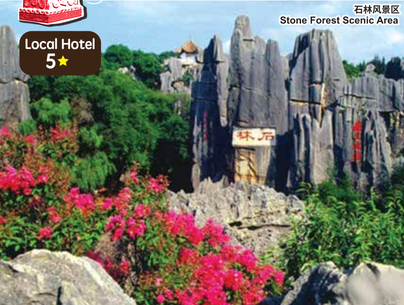
石林风景区 Stone Forest Scenic Area