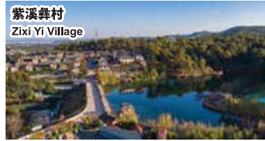
紫溪彝村 Zixi Yi Village