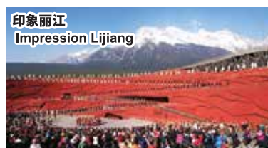
印象丽江 Impression Lijiang